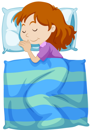
Bie gjumë Sleep time