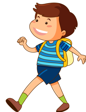
Shkoj në shkollë Go to school