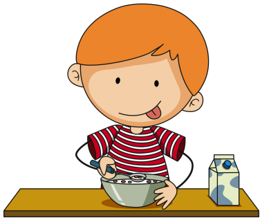
Ha mëngjes Eat breakfast