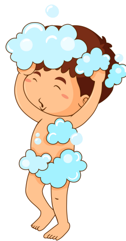
Bëj dush Shower