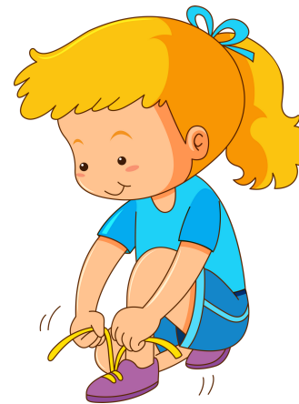
Vesh këpucët Shoes on