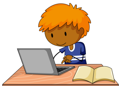
Bëj detyrat Do the assignments