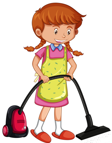
Bëj punët e shtëpisë Do chores