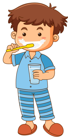
Laj dhëmbët Brush teeth