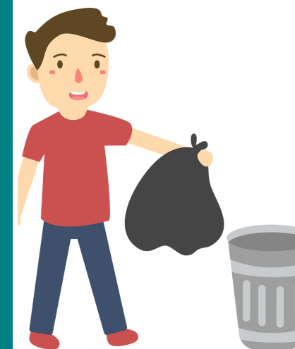
Hedh mbeturinat Take out the trash