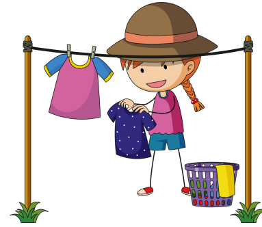
Ndej rrobat Dry the clothes