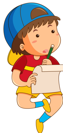
Kontrolloj faturat Check the bills