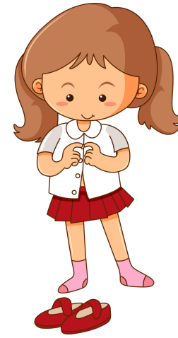
Vishem Get dressed