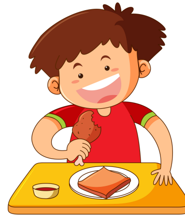
Ha darkë Eat dinner