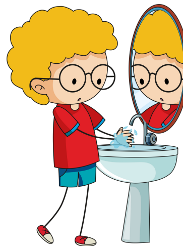
Laj duart Wash hands