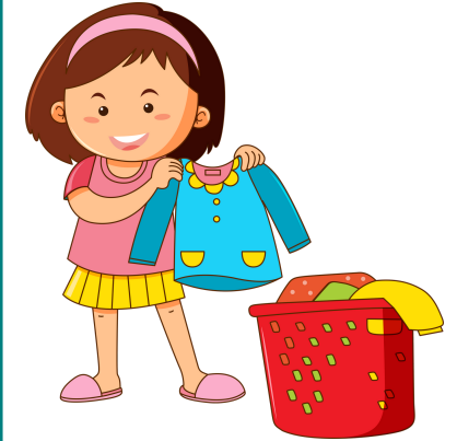
Laj rrobat Wash the clothes