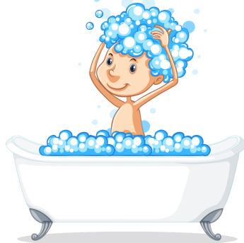
Lahem Wash myself