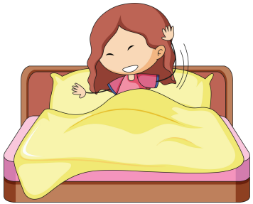
Zgjothem Wake up