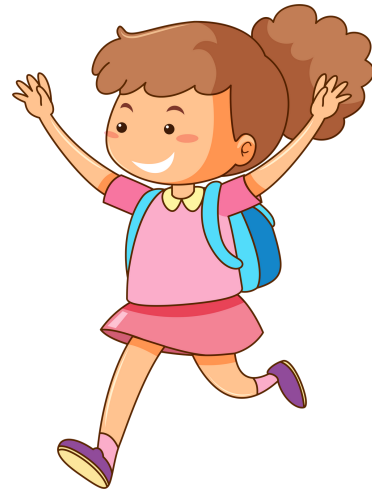
Shkoj në punë Go to work