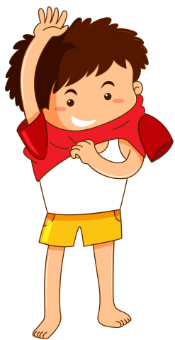
Vishem Get dressed