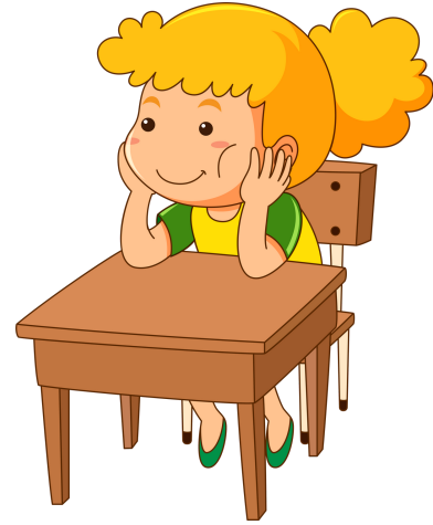
Mësoj shqip Learn Albanian