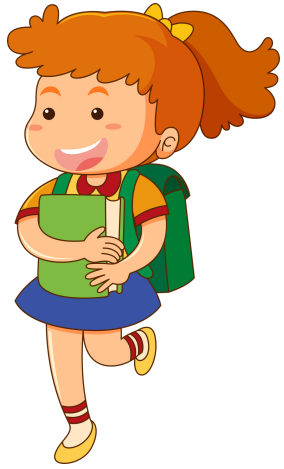
Kthehem në shtëpi Return home