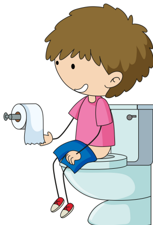
Shkoj në tualet Go to toilet