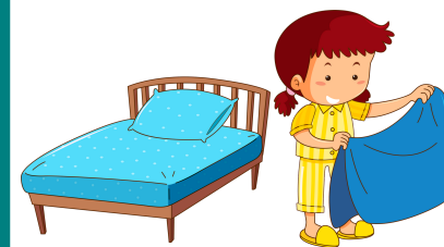
Rregulloj krevatin Make the bed