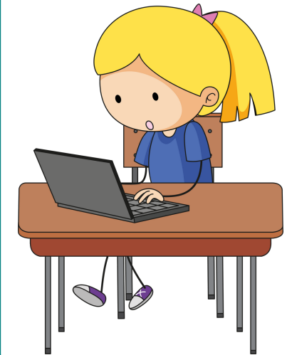
Punoj online Work online