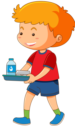
Ha drekë Eat lunch