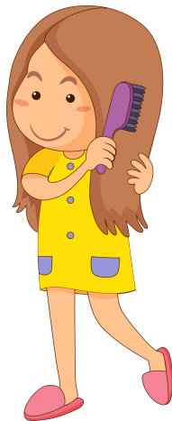
Kreh flokët Brush hair